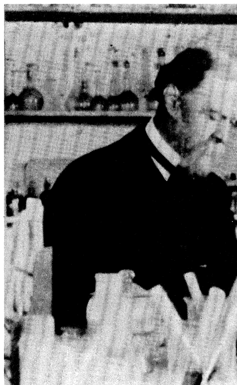
Wolcott Gibbs in his laboratory circa 1880. With his students at the Lawrence Scientific School of Harvard University, Gibbs (1822–1908) added electrogravimetric methods to the chemist's analytical repertoire during the 1860's and 1870's. His researches on cobaltamines and complex inorganic acids, often published in German journals as well as in the American Journal of Science and the American Chemical Journal, were widely known in European chemical circles.

Geologists saw spread before them an entire continent of marvelous resources, from the Palisades, the Catskills, and the Delaware Water Gap in the East, out to the rolling Mississippi Valley in the Midwest, and on to the thousands of square miles of high plains and majestic mountains, the Great Salt Lake, Death Valley, and the Grand Canyon in the West. From Point Sublime in the Grand Canyon geologists could view their subject with a perspective unparalleled until the introduction of the airplane and the space probe. In humid regions, eroded formations were covered by soil; in the starkly arid west numerous instructive features remained unobscured. In fact, American geological formations drew investigators from the world over. Archibald Geikie, after 1882 head of the Geological Survey of the United Kingdom, recognized that the American advantage in the discipline sprang "from the marvellous geological riches of the American continent itself. In minerals and rocks, in stratigraphical fulness, in palaeontological profusion, in physiographical illustrations, the United States have not only no need to borrow from Europe, but in many important respects can produce