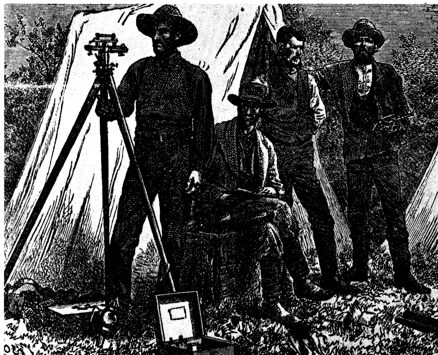
Western scene from early U.S. Geological Survey report—surveyors on an early Survey expedition.

For all King's achievement, his successor John Wesley Powell was still more adept at exploiting the nation's commitment to practical science. Powell aimed to use geological research as a tool to recast the West into a region of economic opportunity, and he made the Survey into a wide-ranging inquiry concerning the physical evolution and economic possibilities of the land. Politically astute, he distributed the Survey's attractively, sometimes lavishly, illustrated publications around the capital.